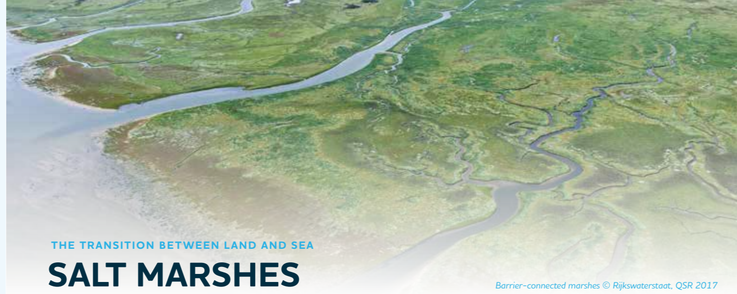
THE TRANSITION BETWEEN LAND AND SEA