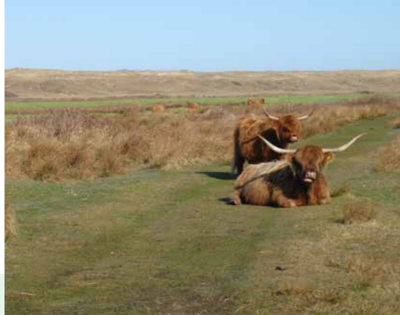
Grazed dune areas