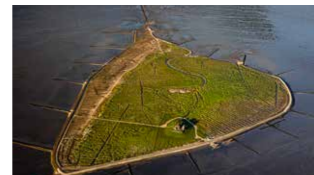
Hallig Marsh