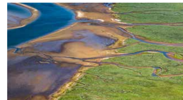
Natural barrier-connected marsh

Salt marshes in the Wadden Sea cover over 40,000 ha, representing 1/5 of Europe's coastal salt marshes. After centuries of habitat loss of mainland marshes, both barrier-connected and mainland salt marshes have expanded by 3,750 ha in recent years. Restoration projects, especially de-embankment of summer polders in the Netherlands and Lower Saxony, added 1,160 ha of salt marshes since 1995.