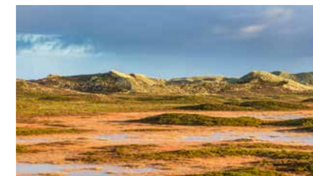
Wet dune slack